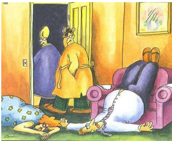
The Arnolds feign death until the Wagners, sensing awkwardness, are compelled to leave.